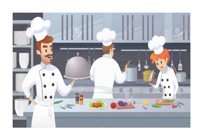
Food and Hospitality