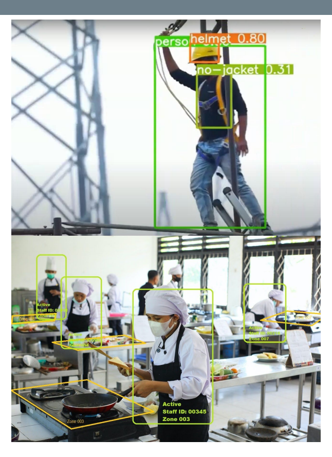
Safety & Hygiene Compliance