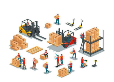
Transport and Warehouses