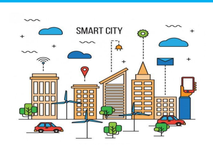
Smart City and Surveillance