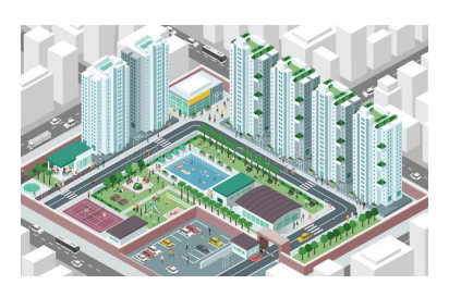
Real Estate & Housing Society